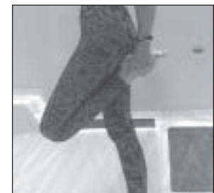
Alternate Quad Stretch

Leg Forward: Balance with one hand on wall; bend outside leg at knee; raise to 90 degrees if comfortable; extend the leg and lower foot to floor.